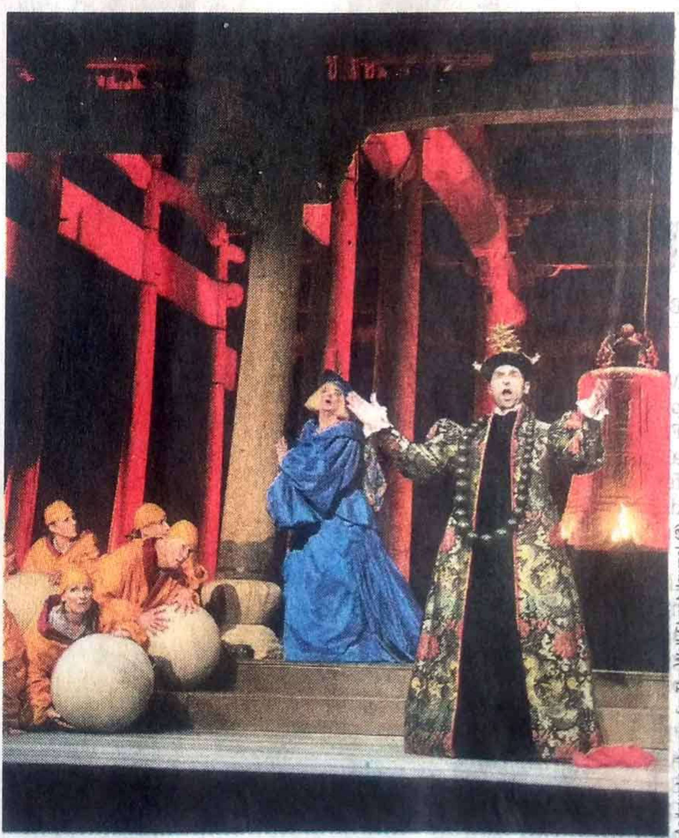
(2)

Even in Handel's time, "Semele" was considered to be pro-